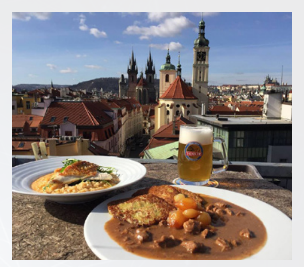
April 4 19.30 T-Anker

The elevator from the street OD Kotva (5th floor) Náměstí Republiky 656/8 110 00 Praha 1